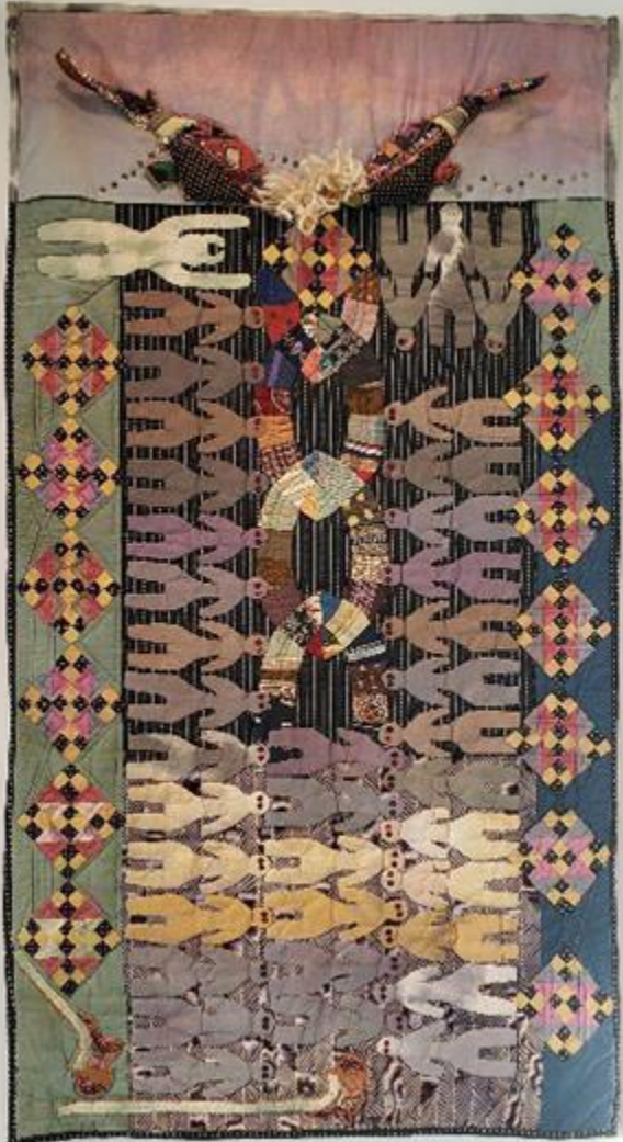
The Harvest, 1989