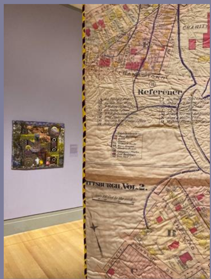
Sequences: Soul Spirit Heart, from Oar Up or Down series, 2023