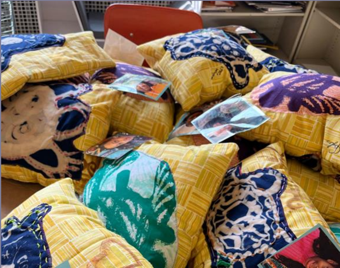
Pittsburgh Linden, 2023