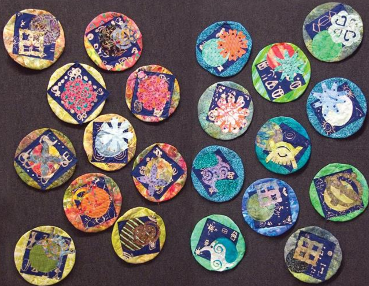
Linden School Residency, 2009