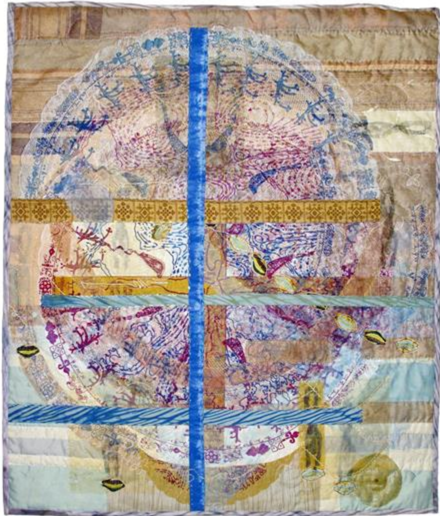
Fractals of the African Diaspora, 2014