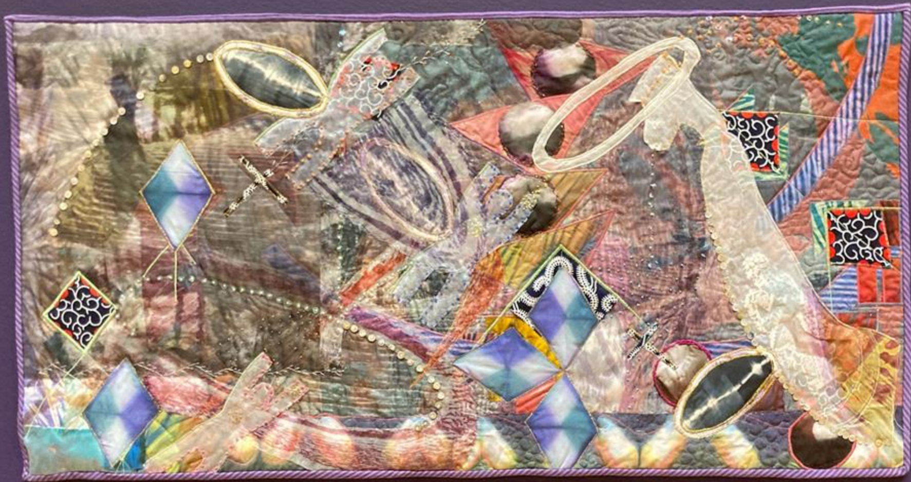
No Mistakes: Seeds of the Motherland, 2023