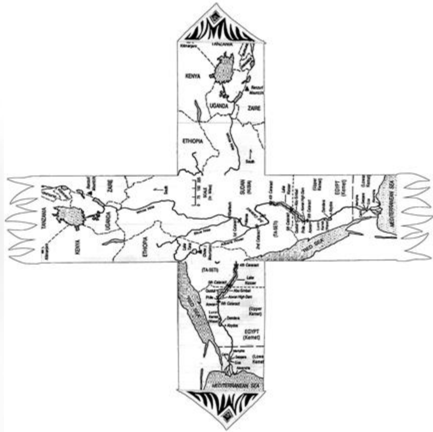
silkscreens of the currents for Diaspora series