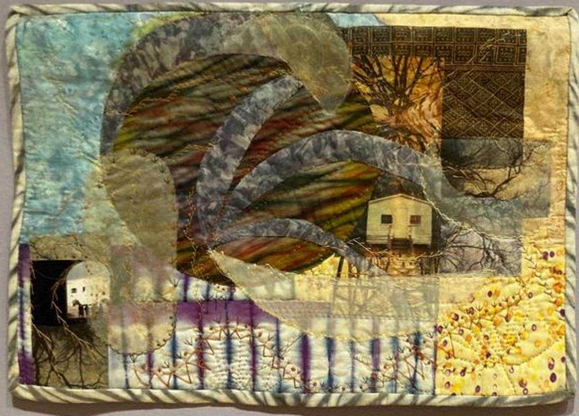
Raise Your Hands, 2006