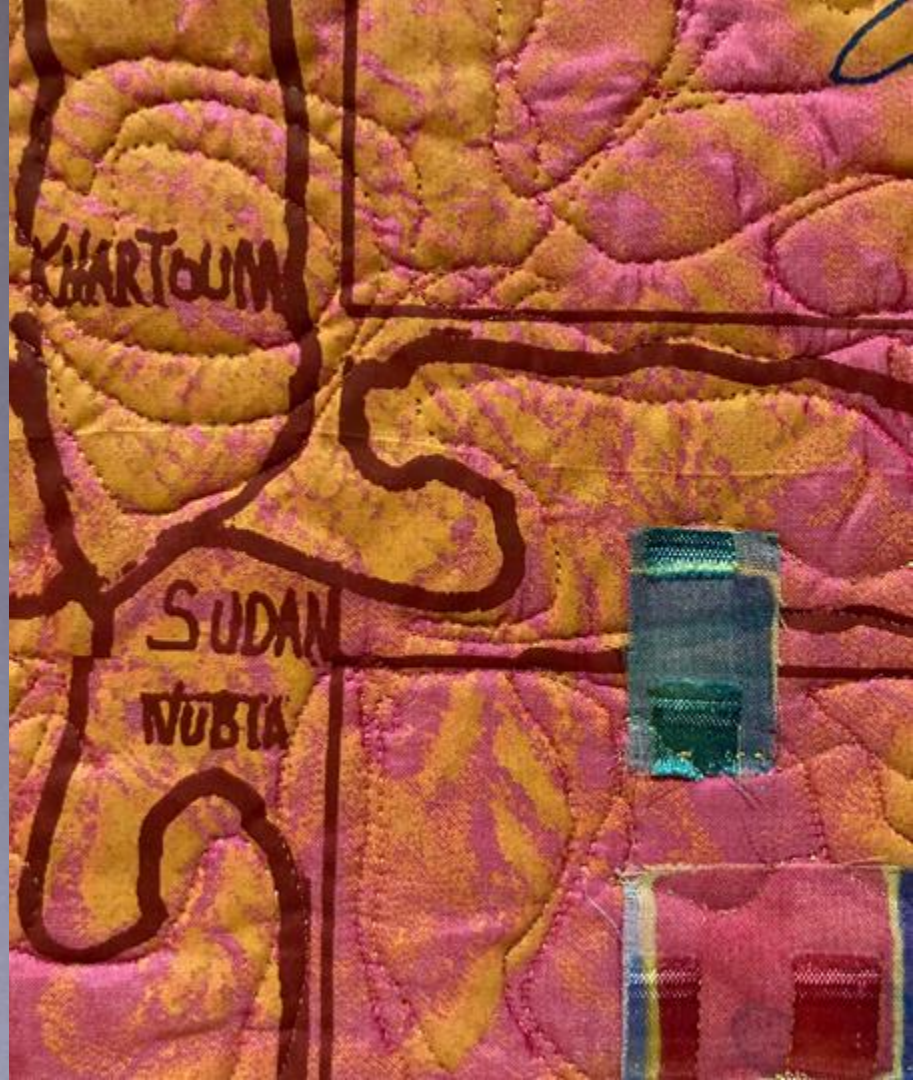
Rising from the Thicket , from the Diaspora series, 2014