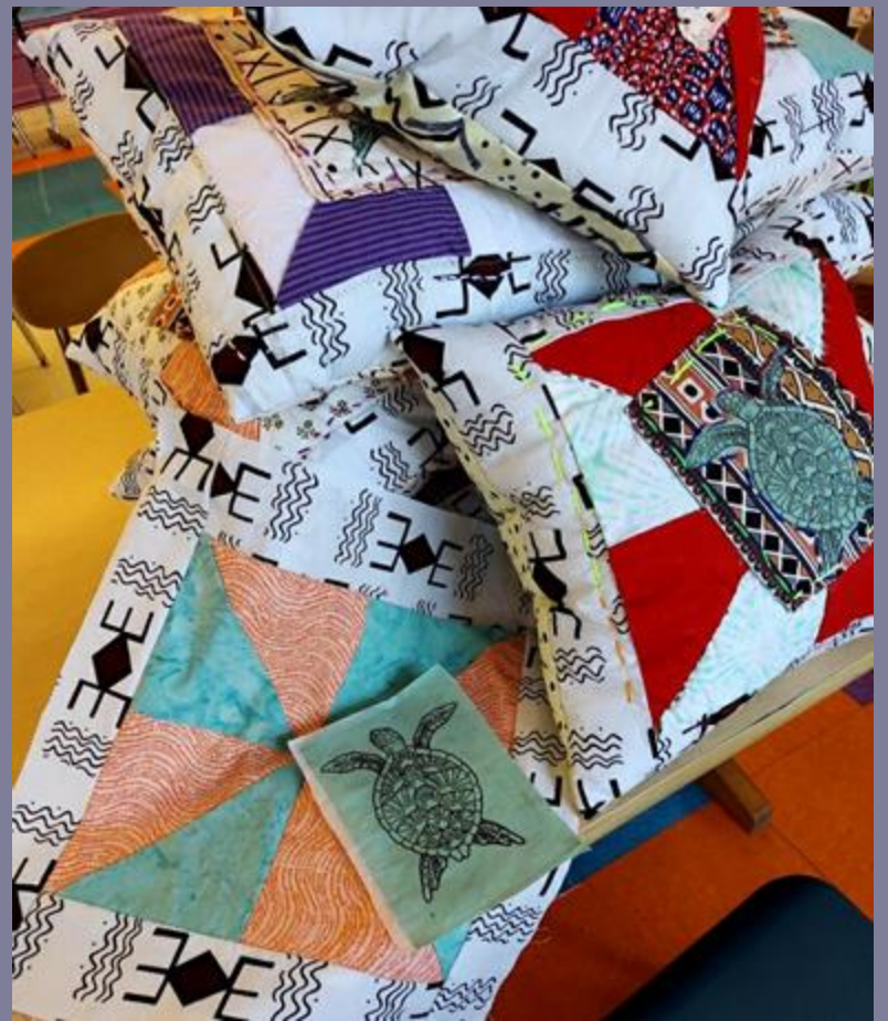
Pittsburgh Linden, 2023