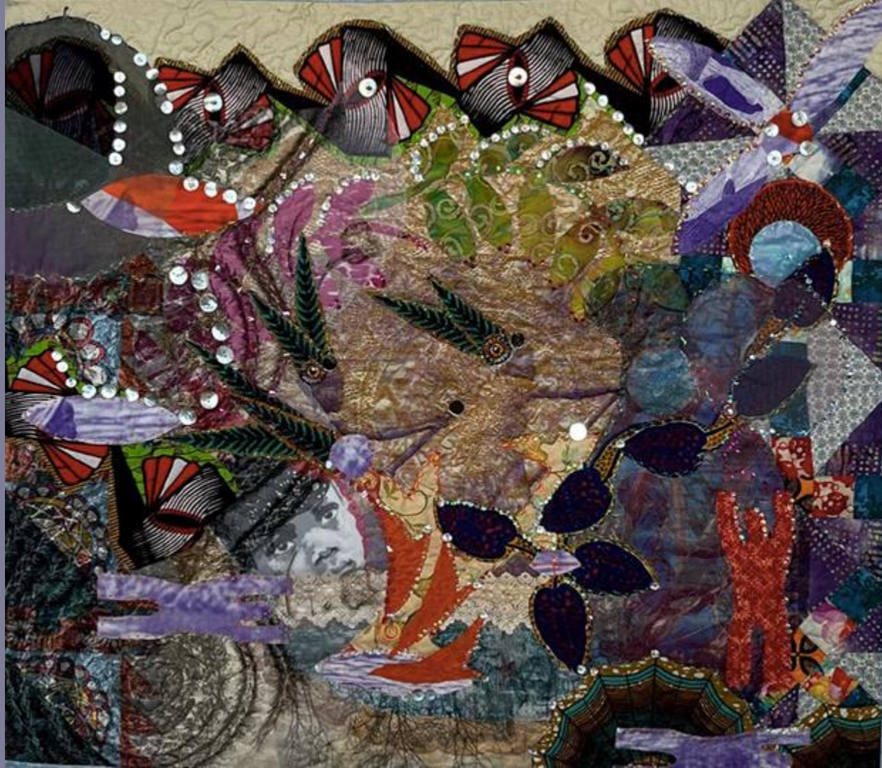
Reflections on a Lush Life, from the Oar Up or Down series, 2023