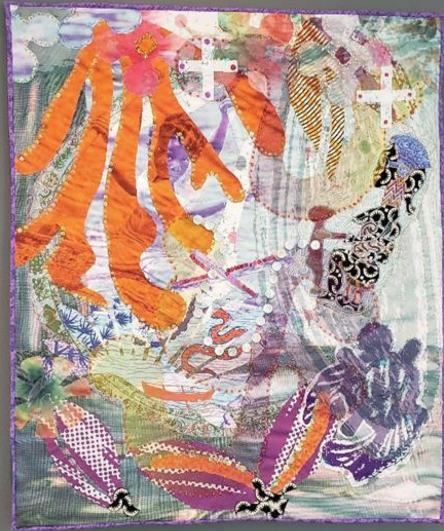
Transcending Travelers, from the Oar Up or Down series, 2021