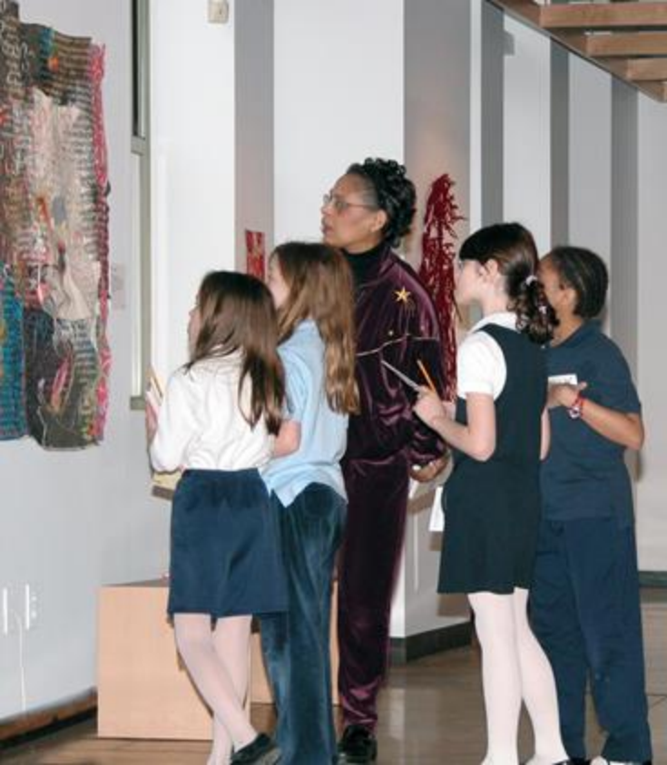
Allegheny Traditional Academy visiting Fiberarts International at Contemporary Craft

Exhibition at Penn State, New Kensington