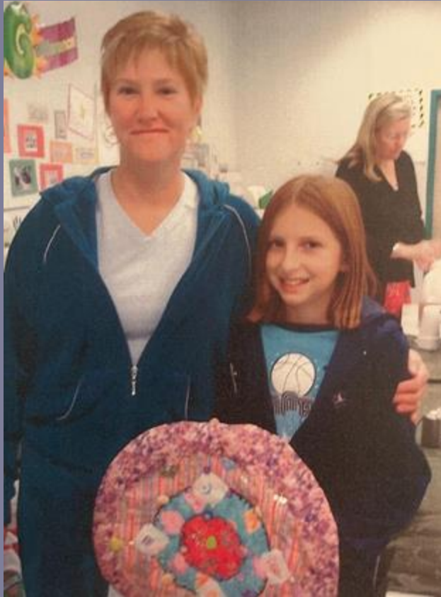
West Liberty/Pittsburgh Traditional Academy Residency Family Traditions, 1995-2007