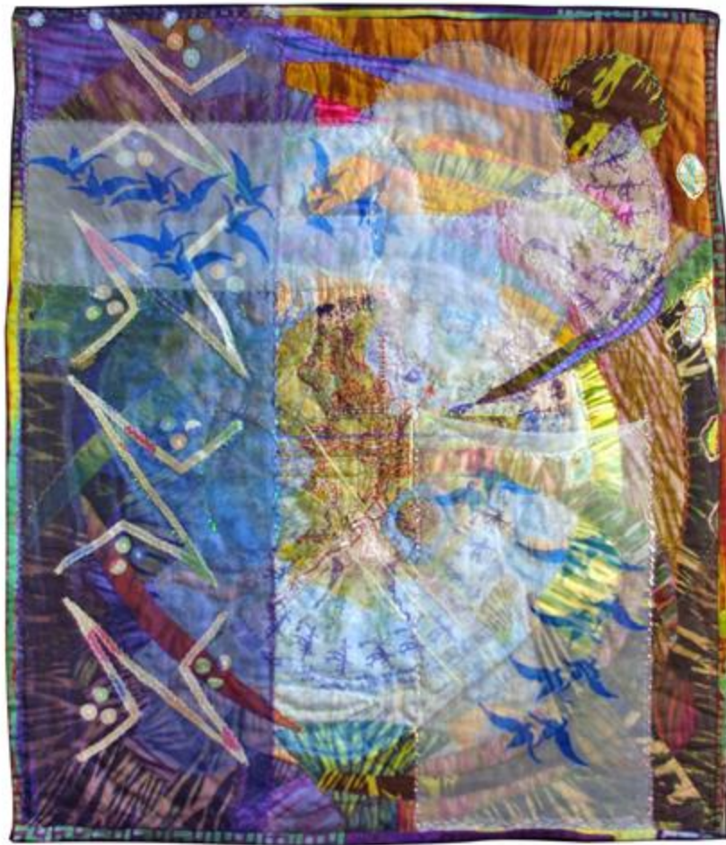
As It Is Above, So It Is Below, 2012